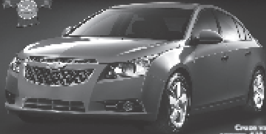
Cruze value approx. $18,199

Proceeds will be used to air condition the cafeteria and for student financial aid. The winner need not be present to win. Car must be titled to a person 18 years or older. Car pickup is the responsibility of the winner and must be claimed within 30 days. Sales and income taxes are the responsibility of the winner.